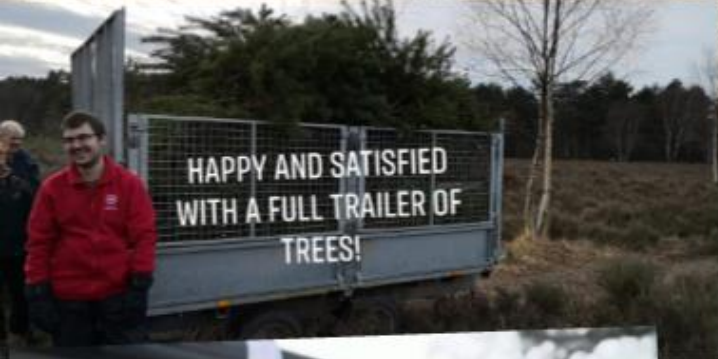
HAPPY AND SATISFIED WITH A FULL TRAILER OF TREES!