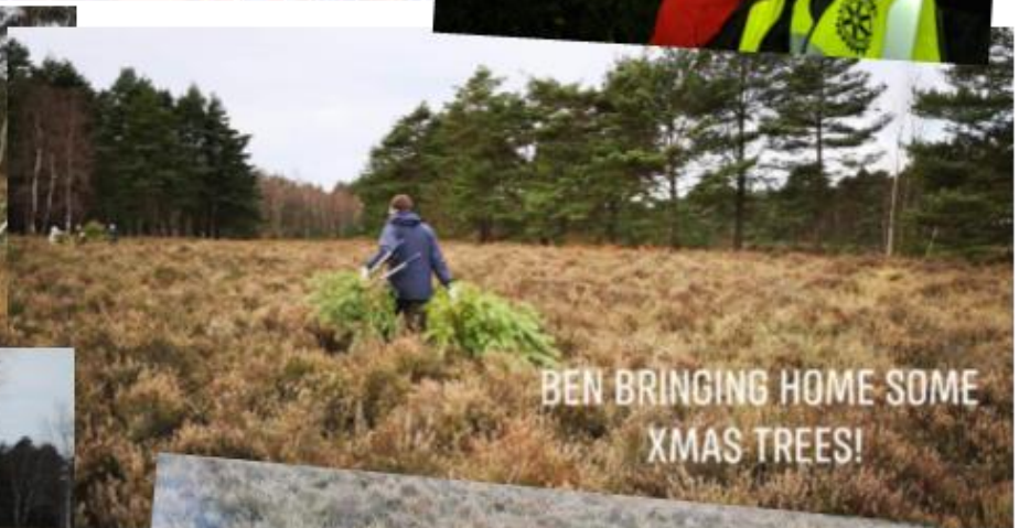
BEN BRINGING HOME SOME XMAS TREES!